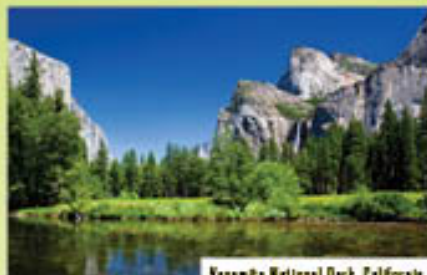
Yosemite National Park, California