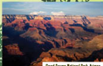
Grand Canyon National Park, Arizona