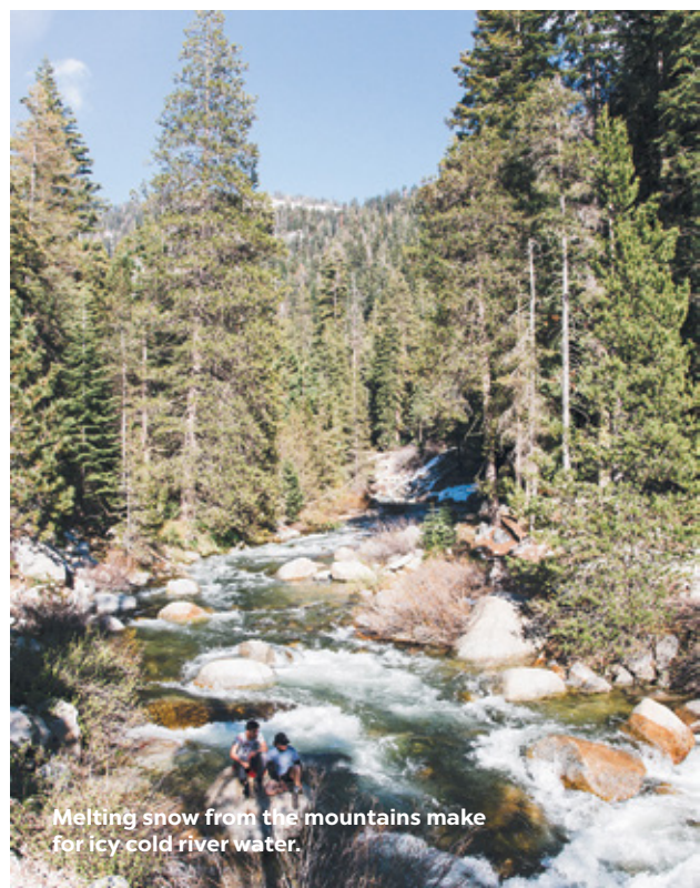
Melting snow from the mountains make for icy cold river water.