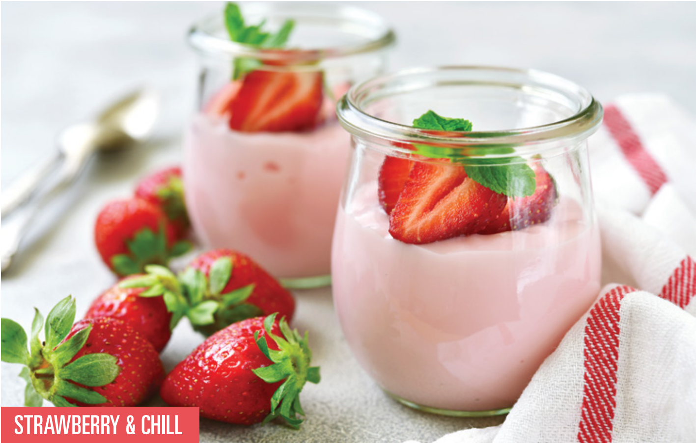
STRAWBERRY & CHILL