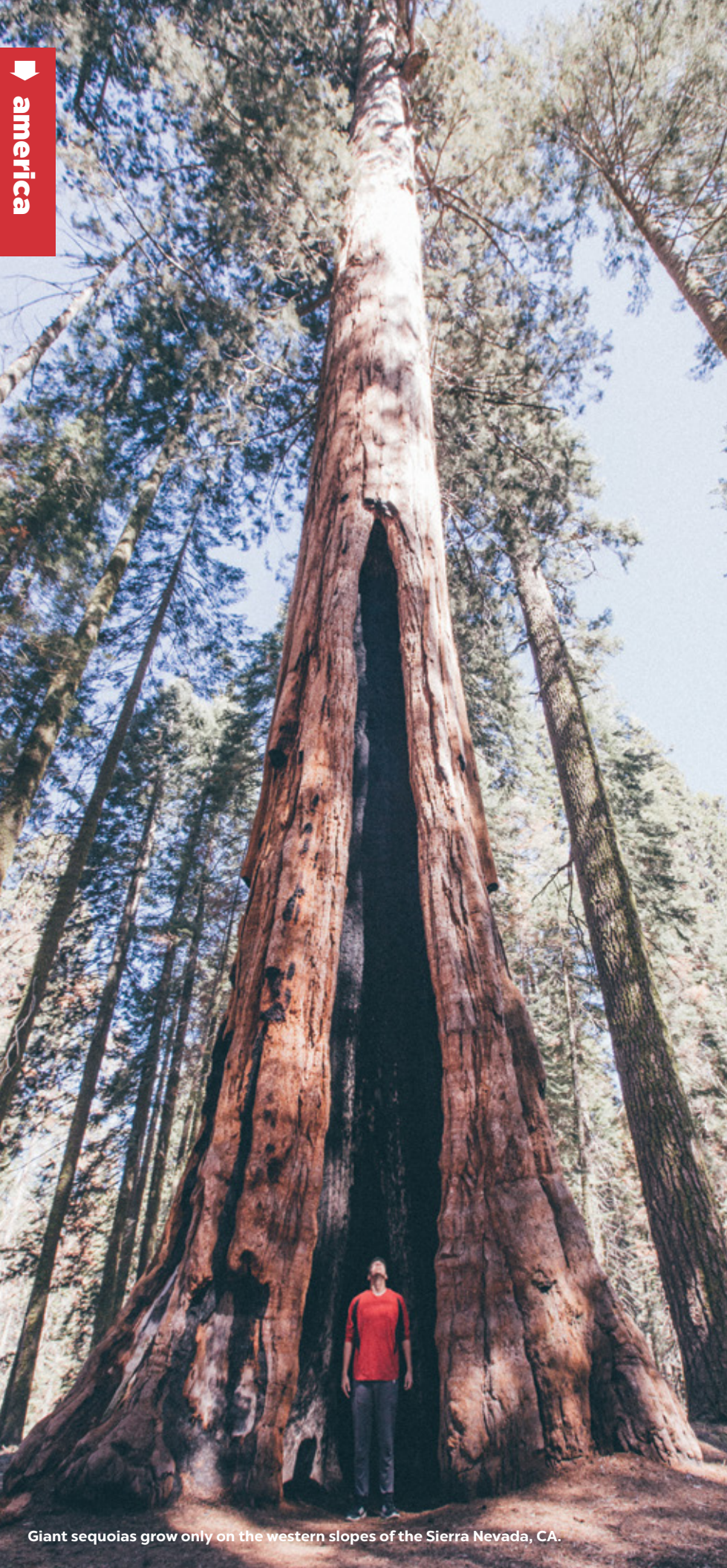
Giant sequoias grow only on the western slopes of the Sierra Nevada, CA.